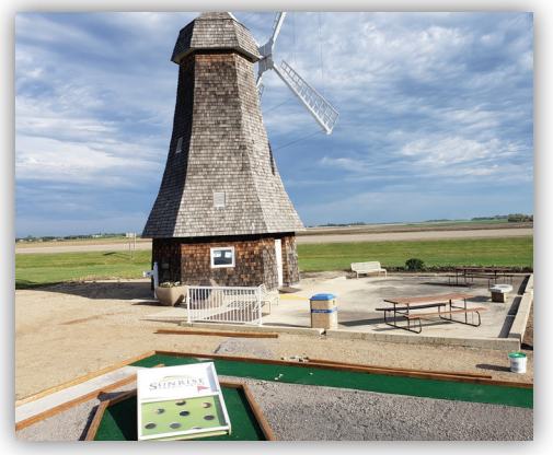
Holland put the final touches on their new mini-golf course in 2019. Sunrise was pleased to sponsor the hole that is adjacent to the town's windmill.