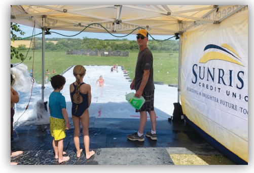
Sunrise Credit Union sponsored the Foam Slip and Slide Party at the Grandview Kinsmen Mud Bog in August.