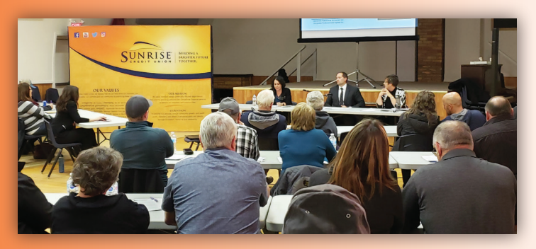
Sunrise Credit Union hosted Farm Succession and Wealth Management seminars in several of our communities in 2019.