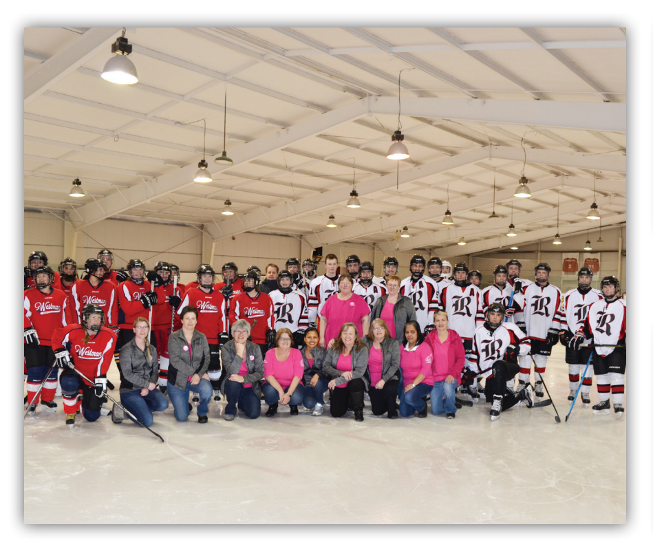
Sunrise Credit Union, Reston branch, hosted a very successful 6th Annual Stick it to Cancer fundraiser in March, raising over $2,900 for the Breast Cancer Foundation.